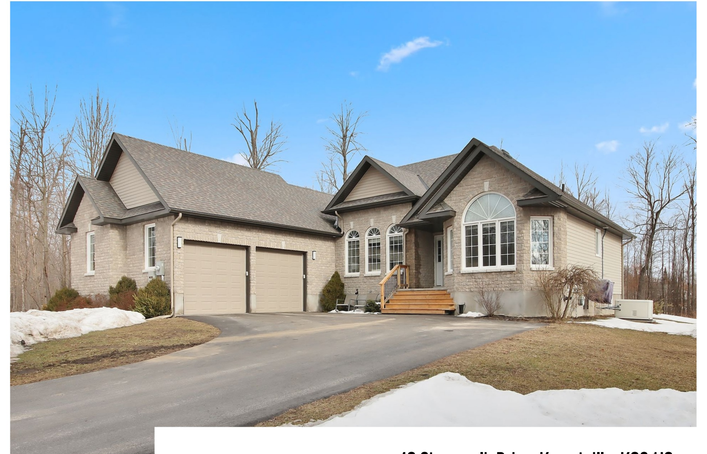
40 Stonewalk Drive, Kemptville, K0G 1J0