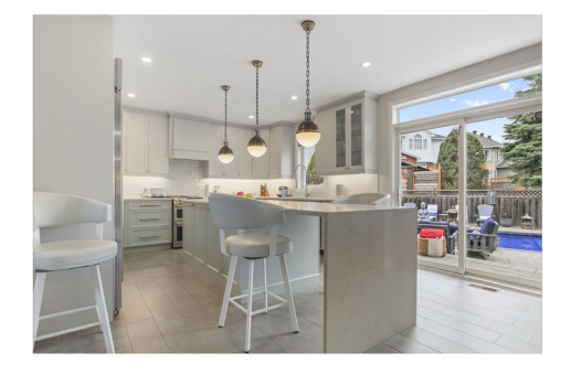
■ Beds: 4+1