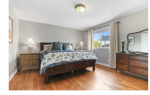
■ Taxes: $6,041 / 2024