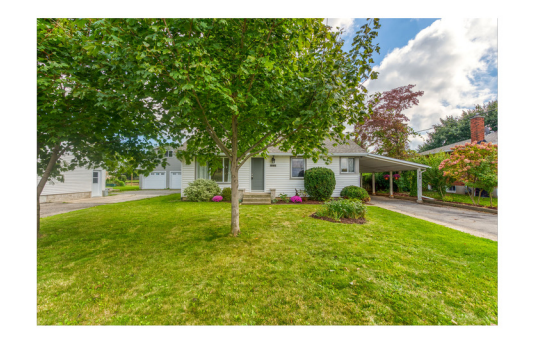
■ Baths: 1

■ Taxes: $3,549 / 2024 ■ Sq. Footage: 921 ft